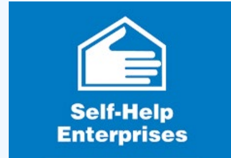
Self-Help Enterprises (SHE)