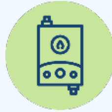
Heat pump water heater