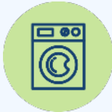
Induction range or cooktop