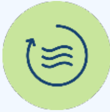
Heat pump (heating and cooling)