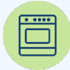
Electric clothes dryer